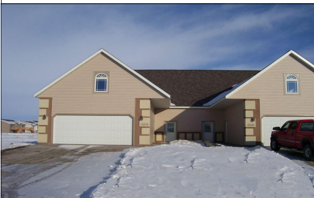
5,438 square foot Duplex with Earth Storage System in the lower level and Radiant Ceiling System in the upper level.